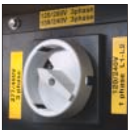
QAS 18-30-QAS 228